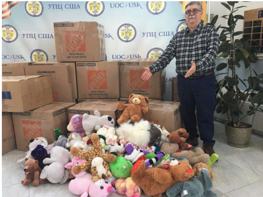
Project Stuffed Animal Drop!